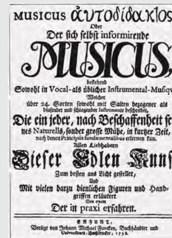
Abb. 10.6: Titelblatt der Schrift »Musicus autodidactos«, Erfurt 1738

For "self-learning" exists, according to Ulrich Mueller of the workshop for new learning culture "no single universally accepted term use, but it prevailed a great variety of terminology, such as self-organized, [...] independent learning or self-directed learning." 4 All terms are for learning methods that give the learner a greater degree of self-determination.