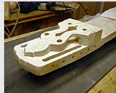
Below: Reinforcement for the tuning pegs