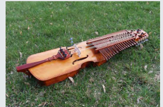
A nyckelharpa made by the author in 2007

The basic objective of these seminars and courses, all of which are open to foreign attendees, is to give makers a good opportunity to meet each other and to share knowledge. A main topic is chosen for each session and often reflects what is happening within the nyckelharpa making world. The seminar and courses are always done together with skilled nyckelharpa players.