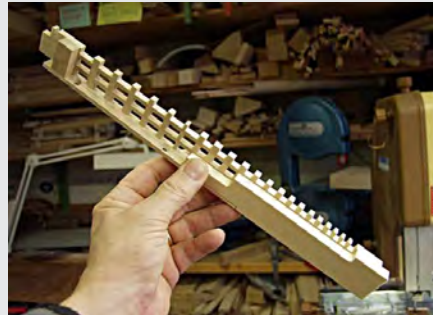
Key box right side and left side