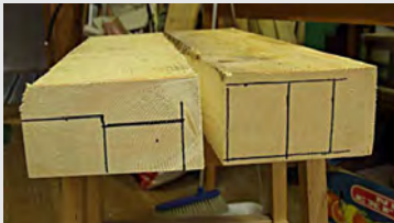
Above: The sides can be cut out from a thick spruce plank