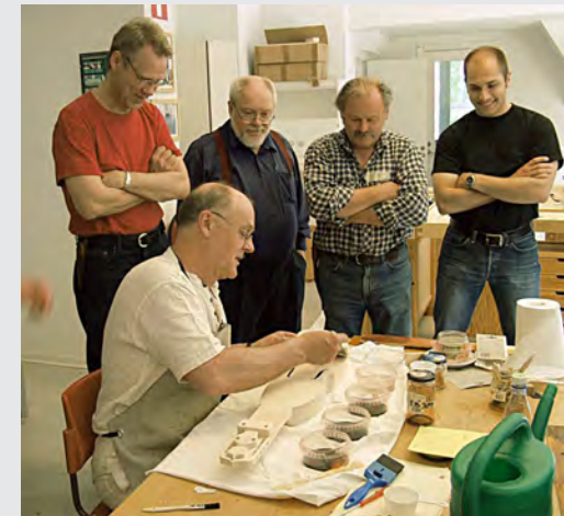
Staining takes concentration. Here at a summer Master Class