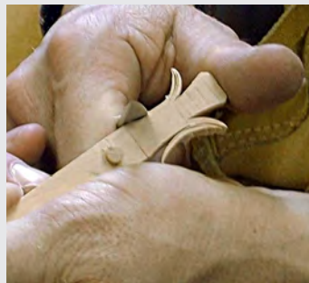
How to cut out the key head