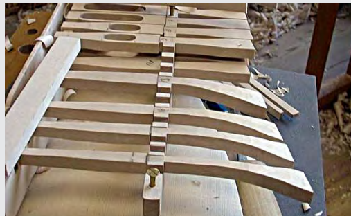
Bent down keys