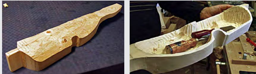
To make a copy of an old nyckelharpa, "Gammelharpa", you have to work directly on the full spruce log. It takes an awful lot of hard work to hollow out the inside.

English language checked by Do Ann Holzman from USA