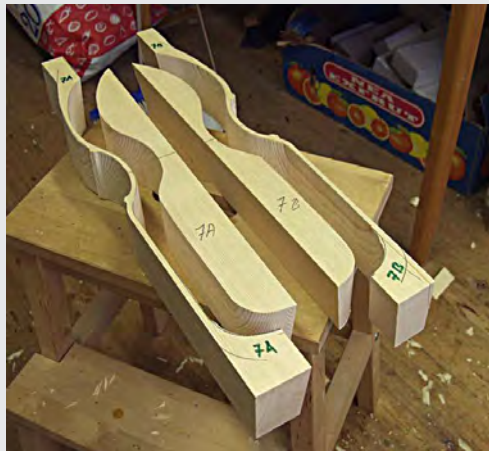
Right: Sides are cut out with a band saw