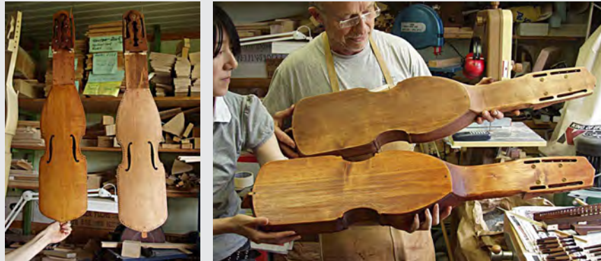
Before and after applying shellac on top of the stain color. Shellac change the color to more yellow and red.