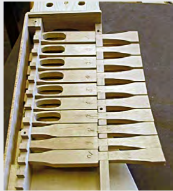
Intermediate row key blanks