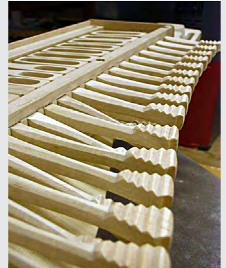
The final key box before staining