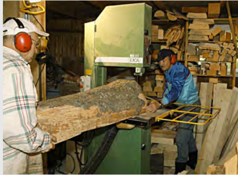
Above: The author with a friend with a spruce log in the band saw machine. Cutting out pieces for the body frame and bottom